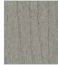
Earth Gray B-58