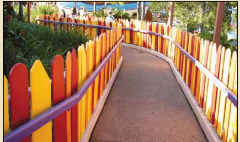
Available with Wood Grain