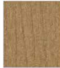
Light Oak B-60