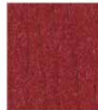
Dark Red C-30