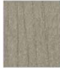
Dove Gray B-52