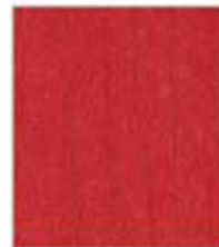
Bright Red C-32