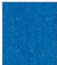
Royal Blue B-42