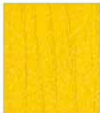
Marker Yellow C-62