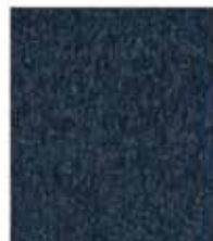
Patriot Blue B-41