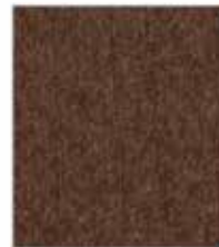
Dark Redwood B-99