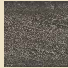
4" x 4"

EVOLVE custom extrusions are solid to the core, so even when cut the exposed product maintains an attractive, consistent color. This consistent core of color means products made with EVOLVE look newer longer, because scratches and dents are nearly indistinguishable.