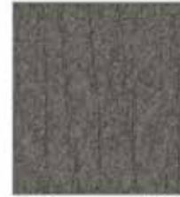
Dark Gray B-55