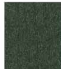
Dark Green B-70