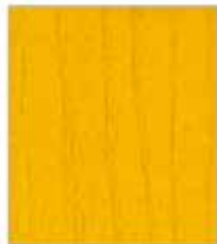
Post Yellow C-64