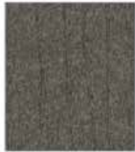
Charcoal Gray B-54