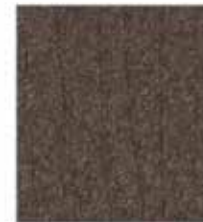
Dark Chocolate B-98