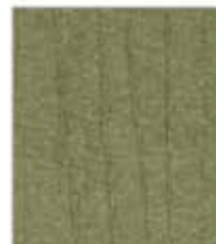
Fern Green B-74