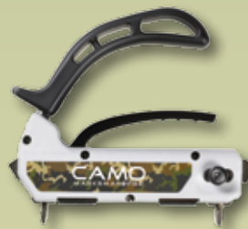
Automatic 3/16" SPACING