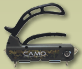
Automatic 1/16" SPACING