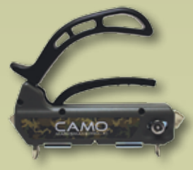
Automatic 1/16" SPACING